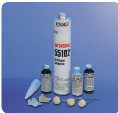
WINDSHIELD INSTALL PACKAGE Contains: Tube Urethane Adhesive (10.5 oz), Metal Primer (1.1 oz), Glass Primer (1.1 oz), Application Dauber (1), Foam Spacers (10), and Windshield Supports (2). MSQ: 1 Part No. 04864015AB