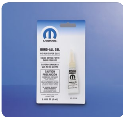
BOND-ALL GEL Super adhesive glue instantly bonds a wide variety of materials. Thick, no-run glue for use on weather stripping, bumper rub strips, body side moldings and many other items where permanent repair is needed. .06 Oz. Tube MSQ: 10 Tubes Part No. 04467709 MS-CC15E