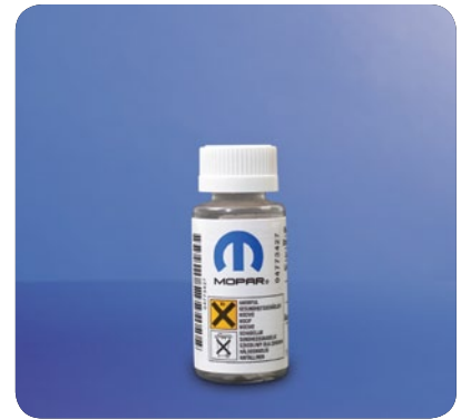
WEATHERSTRIP LUBRICANT Unique Krytox (synthetic fluorinated lubricant) formulation lubricates weatherstripping to prevent it from sticking to door glass and frames. Clear fluid provides long-lasting lubrication. Will not stain or mar clothing. Features built-in sponge applicator. 1 Oz. Bottle MSQ: 1 Bottle Part No. 04773427