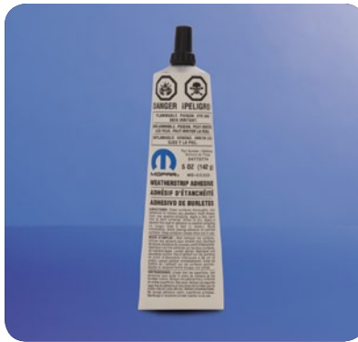
WEATHERSTRIP ADHESIVE Adheres weatherstripping to painted metals for a permanent bond. Withstands heat and freezing conditions; also resists gasoline, kerosene, antifreeze and most solvents. 5 Oz. Tube MSQ: 10 Tubes Part No. 04773774 MS-CC223