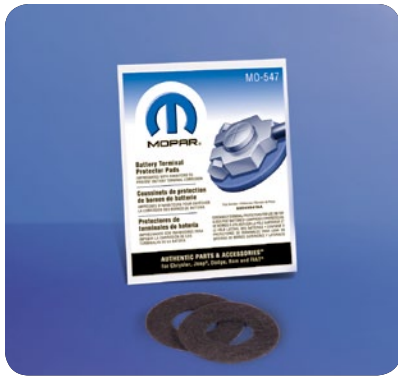
BATTERY TERMINAL PROTECTOR PADS 2 Pads MSQ: 25 Pouches Part No. 68048547AA